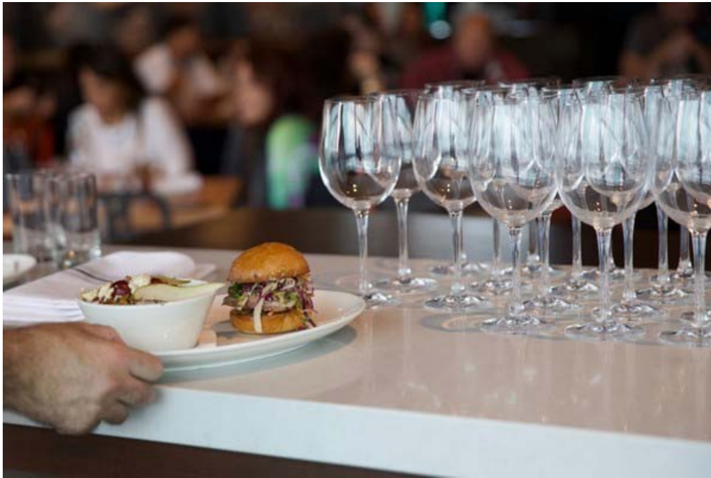
Inside WildFin American Grill in Vancouver.

Both lunch and dinner options incorporate locally sourced meats, seafood, fresh fish and produce. Great starters include Face Rock cheddar fondue and calamari. A few recommended signature dishes that are offered during both lunch and dinner include a fresh and crisp harvest salad - a particularly good choice for those with gluten or vegetarian restrictions - pan-roasted chicken breast and chili prawn macaroni and cheese. The fish tacos are especially popular for lunch while the grilled ribeye tends to be a popular choice for dinner. I suggest saving room for dessert and taking advantage of the season with fresh Washington apple-caramel cobbler. Beverages include barrel-to-bar Oregon and Washington wines, bottled and draft beer, wine and cocktails.